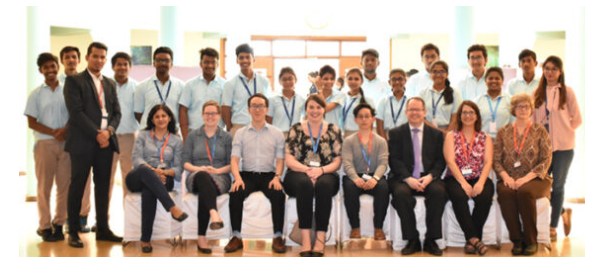
Spoken Foreign Language