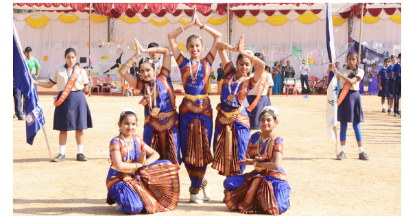
Fine Arts Program